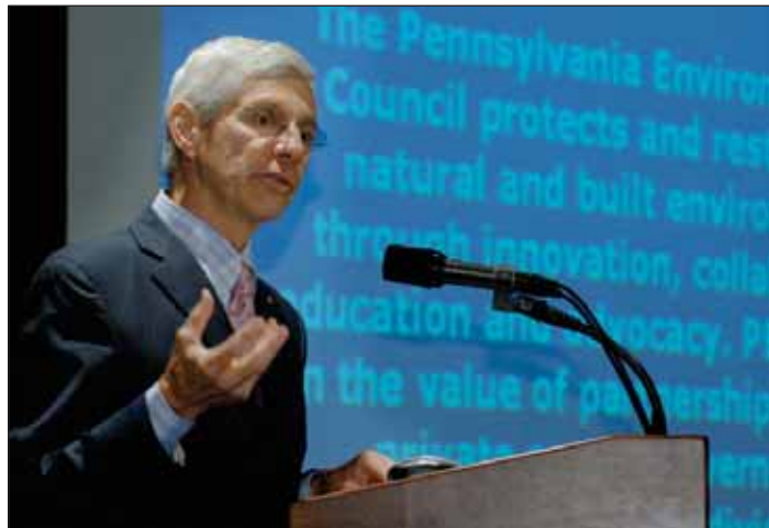
Senator Erickson discusses the Pennsylvania Climate Change Roadmap, nearly 40 recommendations for reducing climate-changing greenhouse gas emissions.

needed to create computerized systems to better diagnose and treat patients.